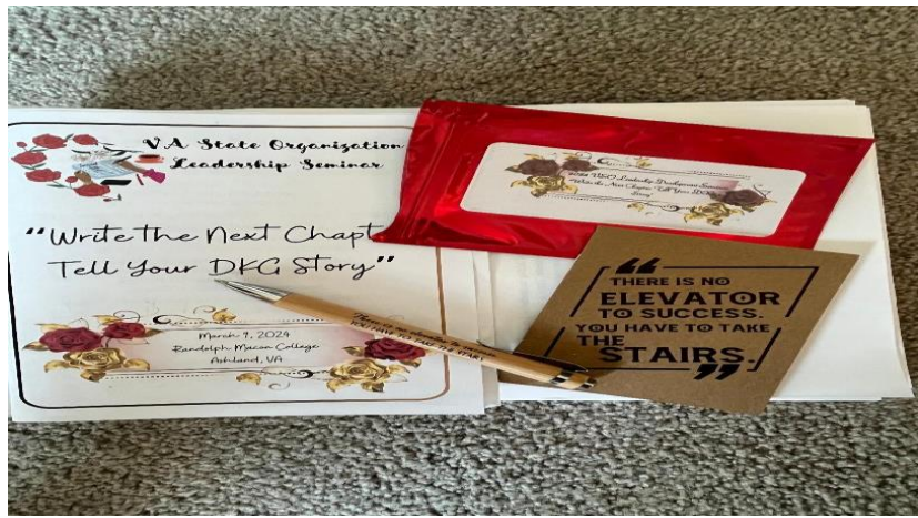
Virginia State Organization Leadership Seminar: "Write The Next Chapter: Tell Your DKG Story:"