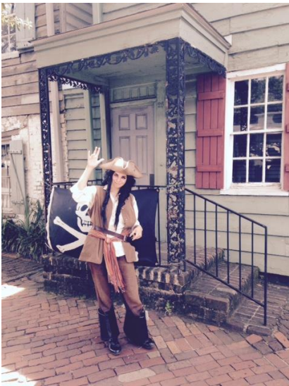
Pirate's House restaurant on Savannah Trolley tour.