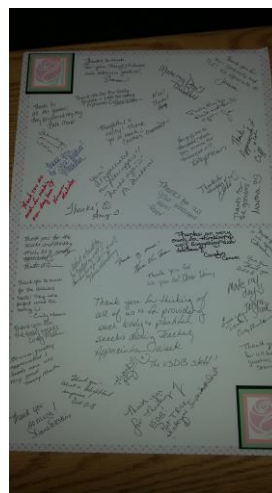
Thank you card from VSDB for goodies during Teacher Appreciation week